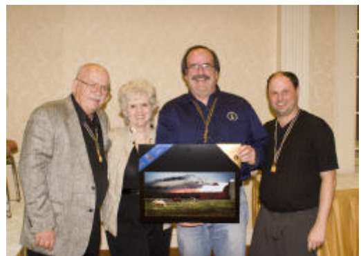
First Place Illustrative Dennis Mignogno "Pasture's Last Light"