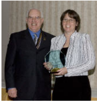
Candid Photographer Paula Mignogno